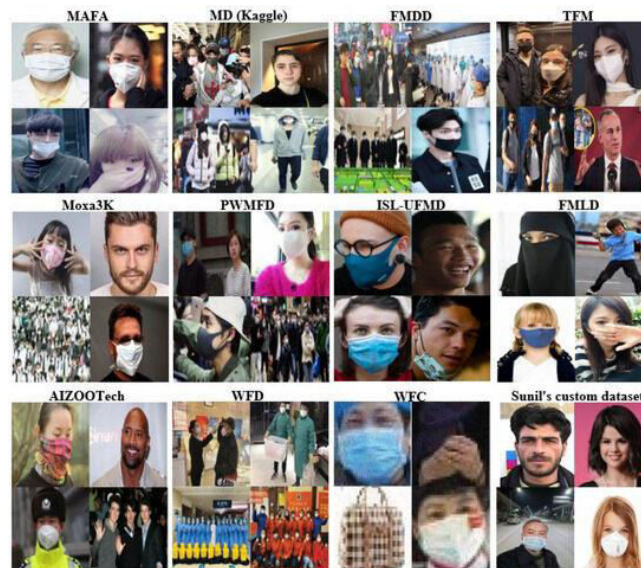
Fig 3: Samples from real masked face datasets used in face mask recognition.

The methodology is structured to cover the complete pipeline, beginning with the systematic collection and preprocessing of multi-modal data, followed by specialized feature extraction modules tailored for masked faces, gait sequences, and ocular dynamics.